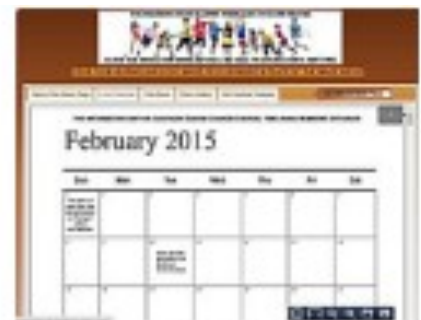
EVENT CALENDAR (DISPLAYS 13 MONTHS) REAL TIME UPLOAD