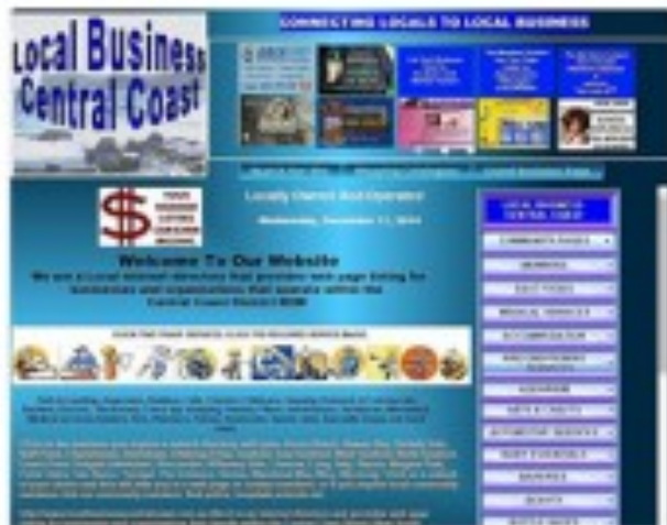
Web Site 1:- localbusinesscentralcoast.com.au

The listing is hosted on 3 web sites & Phone App + an exclusive Database Club