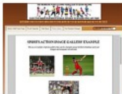
PHOTO GALLERY REAL TIME UPLOAD