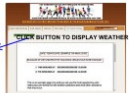
WET WEATHER UPDATE IN REAL TIME