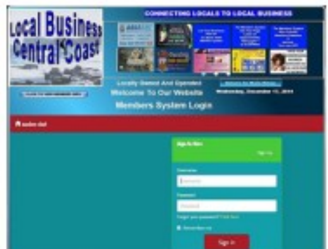
Members Login Page. The Database allows the Business owner to upload information to their Listing in real time. This could be Specials or images or News