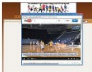
HOME PAGE DISPLAYING VIDEO