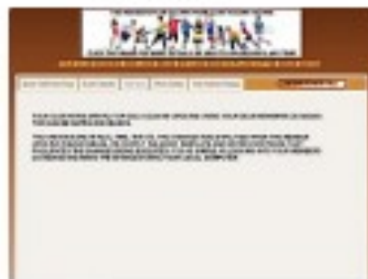
CLUB NEWS REAL TIME UPLOAD