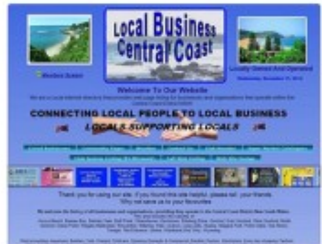
Web Site 2:- localbusinesscentralcoast.com