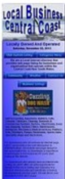
Web Site 3:- Mobile Phone Site